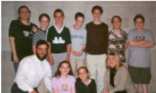
Benei Mitzva Program Class of 5760

As part of the Benei Mitzva Program, meetings are held each year with parents, BEKI officers and staff to discuss religious, educational, planning and logistic issues. Parents are strongly urged to attend these meetings in order to make their experience more meaningful and enjoyable. These meetings also serve as one important feedback vehicle to help us develop the Program to best meet the needs of our families.