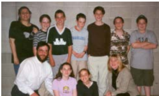
Benei Mitzva Program Class of 5760

As part of the Benei Mitzva Program, meetings are held each year with parents, BEKI officers and staff to discuss religious, educational, planning and logistic issues. Parents are strongly urged to attend these meetings in order to make their experience more meaningful and enjoyable. These meetings also serve as one important feedback vehicle to help us develop the Program to best meet the needs of our families.