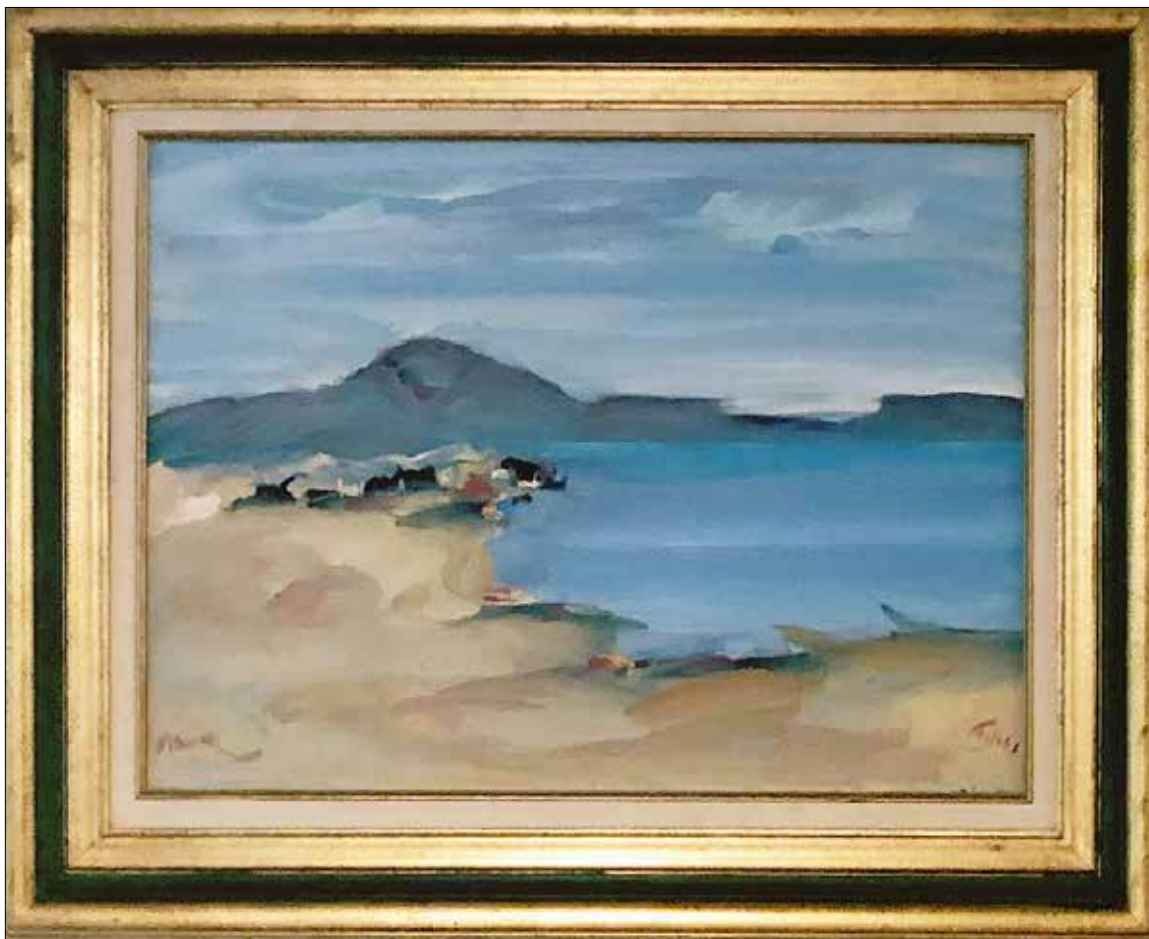
An Israeli landscape watercolor by Mordecai Avniel.