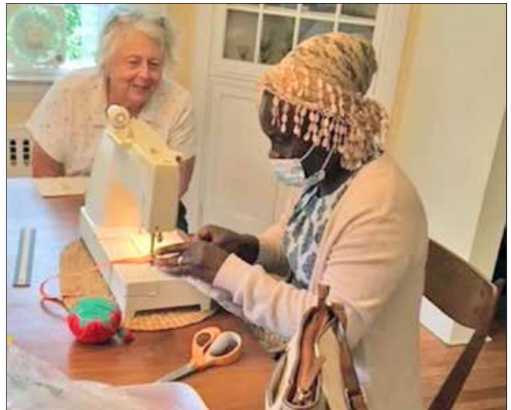
Private sewing lessons were a great success for the mother of JCARR Family 5.

*Pack a Backpack: Purchasing and filling backpacks