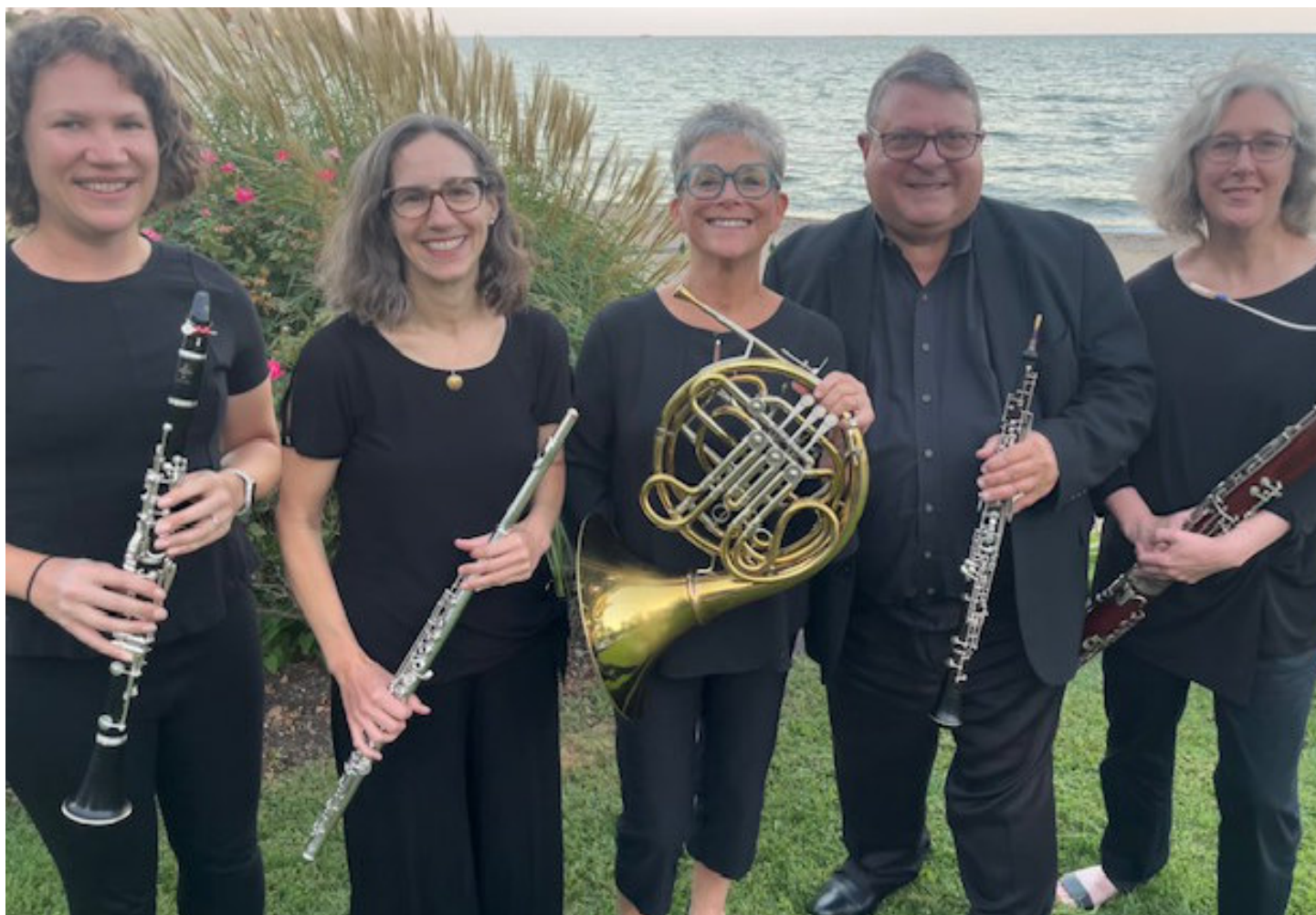
Elm City Winds will return to BEKI for a concert on Sunday, Oct. 26.

Everyone is invited to stay after the concert for 5:45 pm minyan.