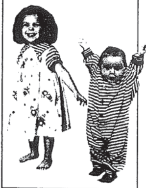
Boys & Girls Infants - Preteen